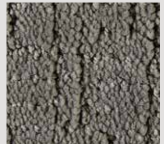
▲ SB: LUU2.0410 | 400 cm