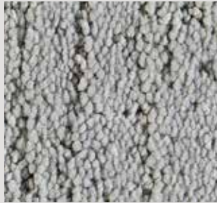
▲ SB: LUU2.0870 | 400 cm