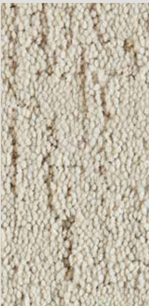
▲ SB: LUU2.0440 | 400 cm