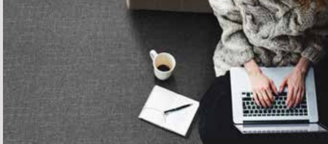
▲ SB: LUU2.0810 | 400 cm