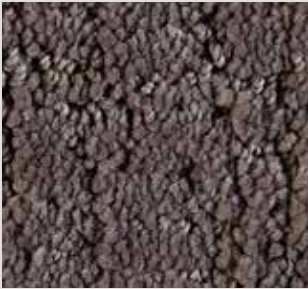
▲ SB: LUU2.0080 | 400 cm