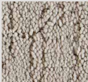
▲ SB: LUU2.0430 | 400 cm