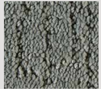
▲ SB: LUU2.0840 | 400 cm