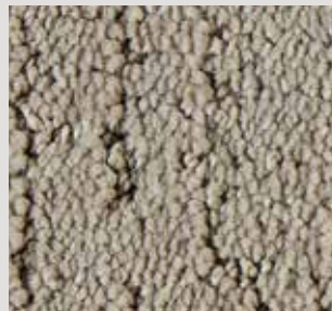
▲ SB: LUU2.0260 | 400 cm