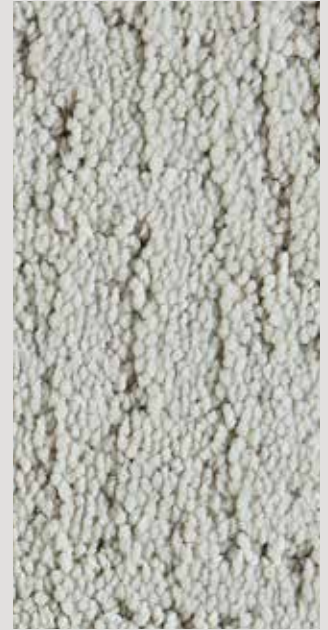
▲ SB: LUU2.0880 | 400 cm