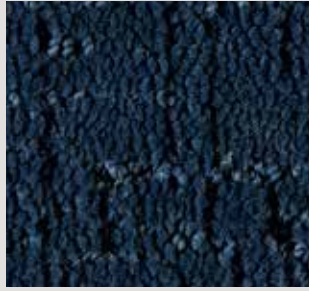
▲ SB: LUU2.0780 | 400 cm